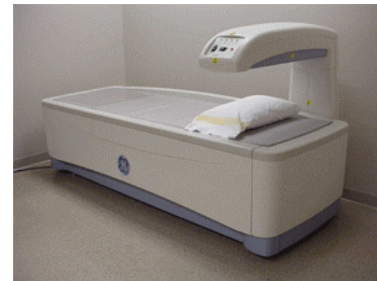
Example of a dexa scanner

It is a painless procedure which takes about 10 minutes and it measures bone density in the lower spine and hips. These measurements give an overall prediction of your bone density and strength. Dexa scans are usually only done in those people at highest risk of osteoporosis and you have to be referred by a doctor.